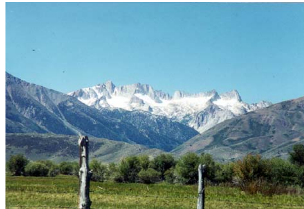
Photo: Bridgeport Valley