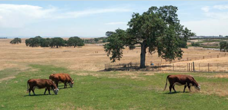
POTTER RANCH