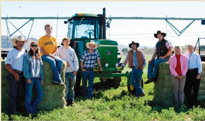
Goodwin Sierra Valley Plumas County