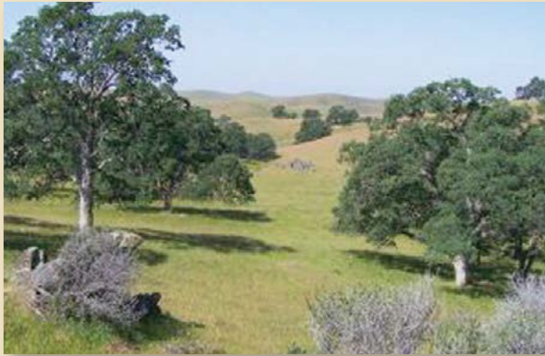
Oakvale Ranch Mariposa County