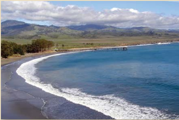
Old San Simeon Village San Luis Obispo County