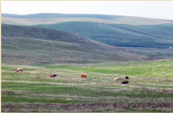
JCR-EAST Ranch Merced County