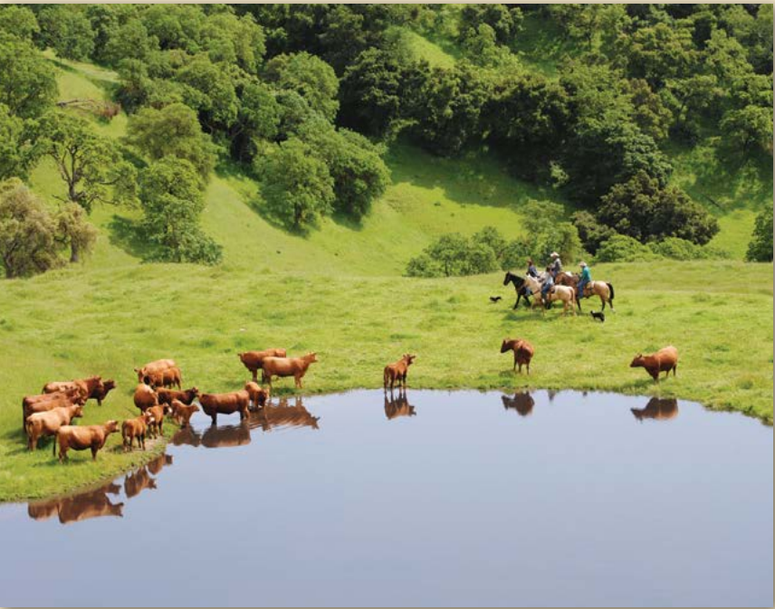
Koopmann family gathers cattle around a pond on their ranch