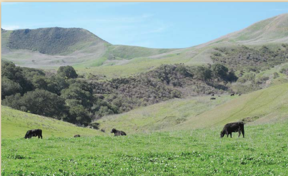
HANSON RANCH