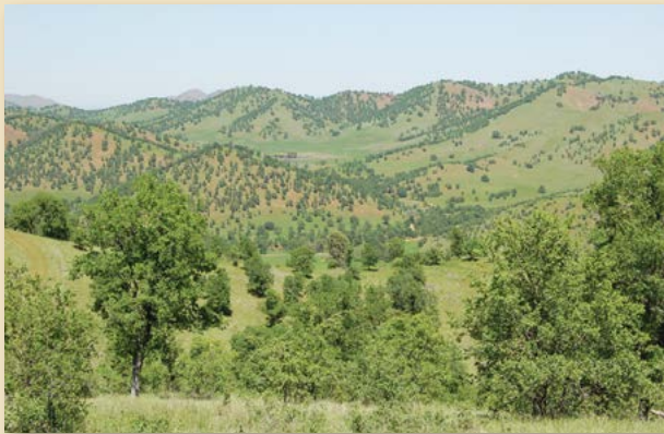
Payne Ranch Colusa County