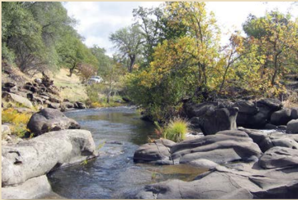
JS Ranch Shasta County