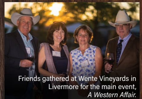
Friends gathered at Wente Vineyards in Livermore for the main event, A Western Affair .