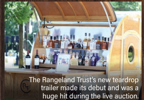
The Rangeland Trust's new teardrop trailer made its debut and was a huge hit during the live auction.