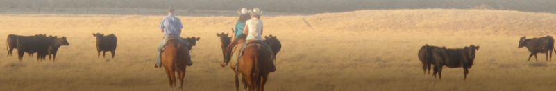
Bear Valley Ranch, Parkfield, California