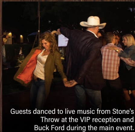
Guests danced to live music from Stone's Throw at the VIP reception and Buck Ford during the main event.

FOR MORE PHOTOS FROM THE EVENT, VISIT OUR ONLINE PHOTO GALLERY AT WWW.SPLIT.TO/ RANGELANDTRUST-AWA-PHOTO- GALLERY .