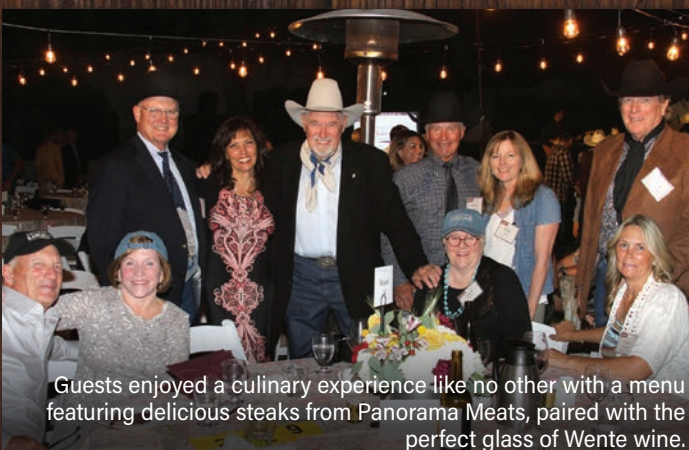
Guests enjoyed a culinary experience like no other with a menu featuring delicious steaks from Panorama Meats, paired with the perfect glass of Wente wine.